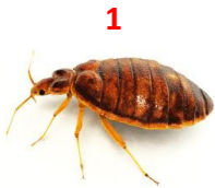
Live Bed Bug