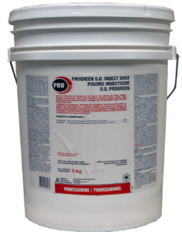
19 liter (5Kg) container