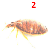
Bed Bug with DE Powder